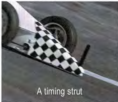
A timing strut

The challenge of Speed Hillclimbing is to drive the course in the shortest possible time. The faster drivers are those who can get the car off the start quickly, the first 64 feet can take under two seconds, and then find the quickest and smoothest lines through each corner. The fastest cars can complete the 1448 metre course in under 50 seconds, with speeds exceeding 130 mph!