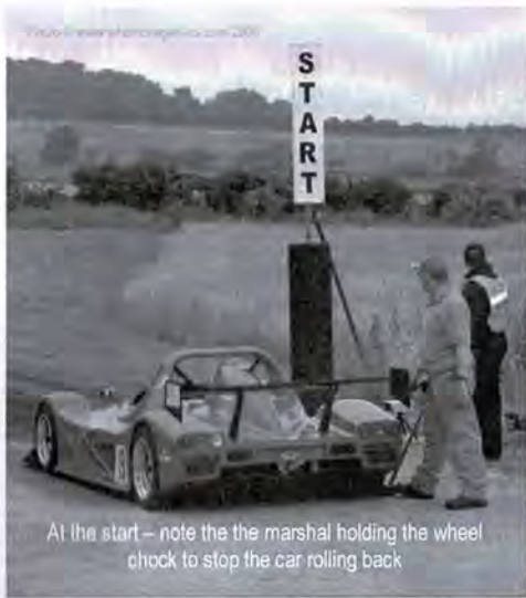
At the start – note the the marshal holding the wheel chock to stop the car rolling back

The ultimate achievement at each event is to establish the Fastest Time of the Day (FTD). This is usually claimed by one of the single seater racing cars, although wet weather can sometimes throw up an occasional surprise!