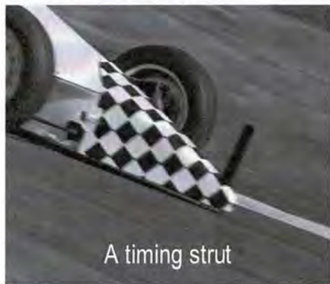
A timing strut

The challenge of Speed Hillclimbing is to drive the course in the shortest possible time. The faster drivers are those who can get the car off the start quickly, the first 64 feet can take under two seconds, and then find the quickest and smoothest lines through each corner. The fastest cars can complete the 1448 metre course in under 50 seconds, with speeds exceeding 130 mph!