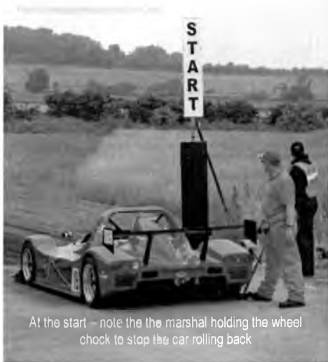
At the start – note the the marshal holding the wheel chock to stop the car rolling back

The ultimate achievement at each event is to establish the Fastest Time of the Day (FTD). This is usually claimed by one of the single seater racing cars, although wet weather can sometimes throw up an occasional surprise!