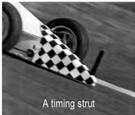
A timing strut

The challenge of Speed Hillclimbing is to drive the course in the shortest possible time. The faster drivers are those who can get the car off the start quickly, the first 64 feet can take under two seconds, and then find the quickest and smoothest lines through each corner. The fastest cars can complete the 1448 metre course in under 50 seconds, with speeds exceeding 130 mph!