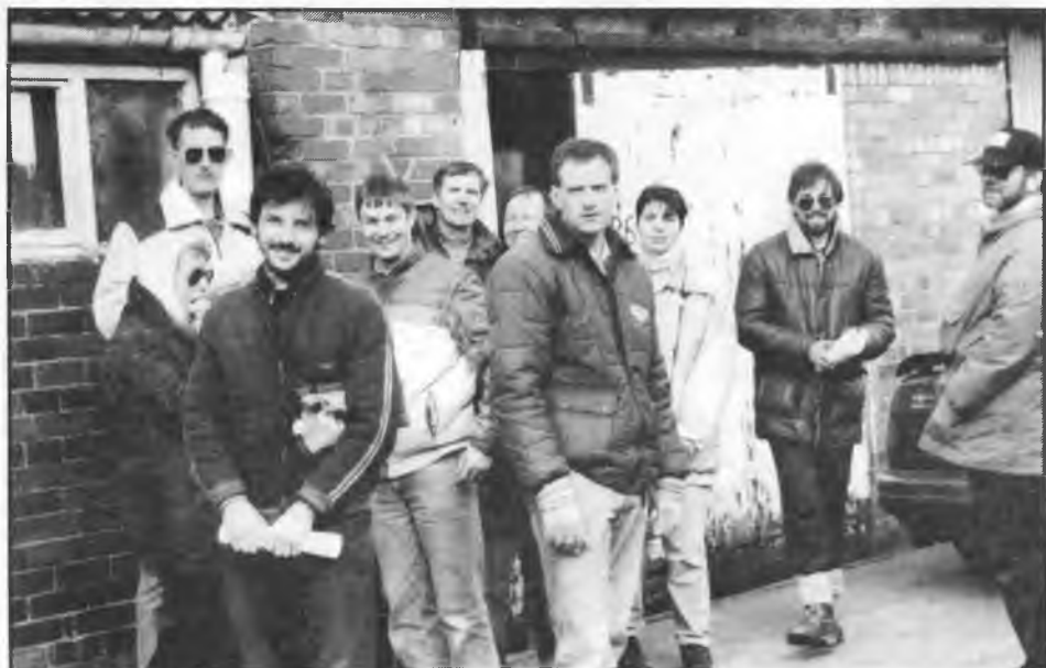
This motley looking bunch are part of our efficient group of marshals who regularly attend our Harewood meetings. Without them, there would be no motor sport.