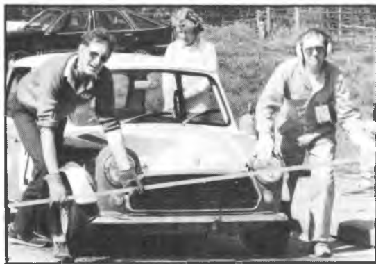
Ever cheerful, the start marshals prepare to line up another batch of cars ready for the start of our Harewood season.