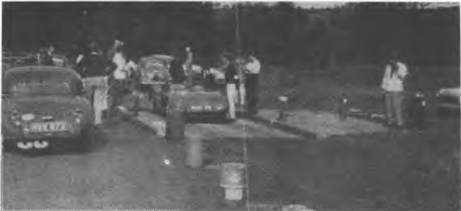
Photograph of the start and assembly area taken in 1962. Note the water filled oil drums which were acceptable in that era but would give the RAC MSA apoplexy today.

In May 1992 the long course was introduced and since that time many on-going improvements have been made to the venues facilities - a resurfaced access road for the public as well as new roads in the paddock, new fencing and seating for the public and better medical provision for competitors. Not content to sit on its laurels, the Centre is planning even more improvements to make the venue a fitting tribute to all the hard work and effort of those who have given freely of their time and at times, money.