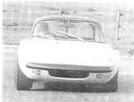
Geoff Goodliffe 68, 69 & 70