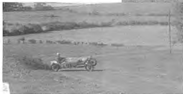
The rear wheel of Nigel Scott's 1929 GN Special digs in causing the car to roll as he exits Farmhouse Corner