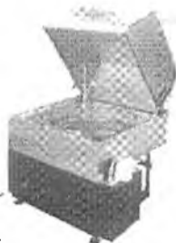
Marr Orbit – the versatile choice for component washing and degreasing

Guyson International Limited. Snaygill Industrial Estate, Keighley Road, Skipton, North Yorkshire BD23 2QR Tel: 01756 799911 Fax: 01756 790213 http://www.guyson.co.uk