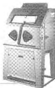
Euroblast® – universal range of manual operated blast cabinets