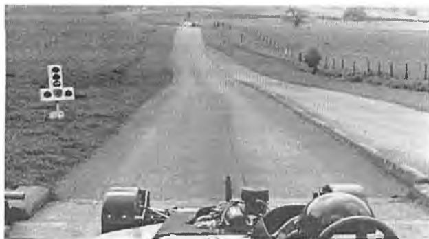
The view facing drivers from the original start line was of the rise before the blind brow at Country Corner

Tony Lanfranchi set Fastest Time of Day at the first Harewood. Note the substantial gate and gateposts entering Orchard Corner.