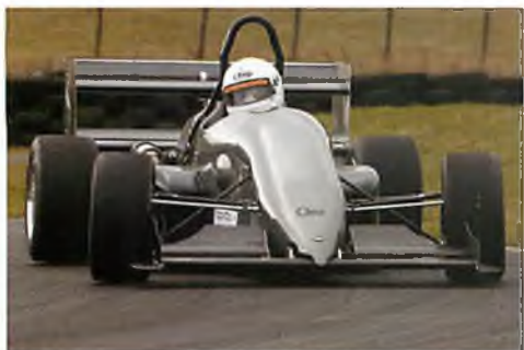
James Blackmore, OMS 2000M, finds a fast line