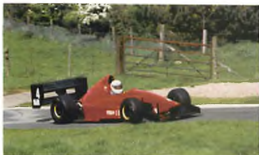
Simon Durling, Gould GR37 under braking approaching Orchard