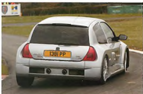
Malcolm Pinder, Renault Clio V6, powers out of Country