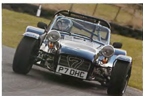
Sarah Cordingley, Caterham 7, on the attack