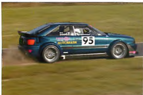
Simon Bainbridge, Audi S2, kicks up the dust