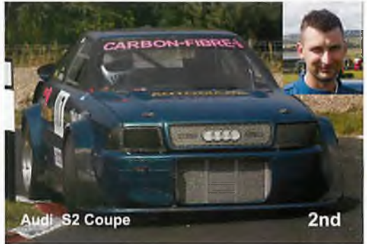
Audi S2 Coupe

Top dog so far this year - Bob Bellerby