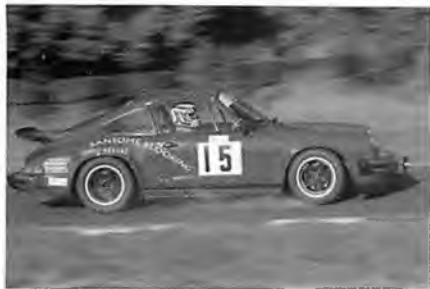
Left Stewart Whitmore locks up a wheel in the Carrera