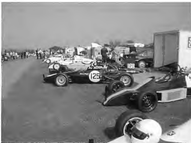
Formula Ford race cars in the paddock at the 1 st August meeting

At the finish line there is another light beam that stops the digital timing equipment for that driver's run. In addition to the start and finish timing beams at Harewood, there are other beams that allow the driver to see their 'split' times at given points on the course after their run.