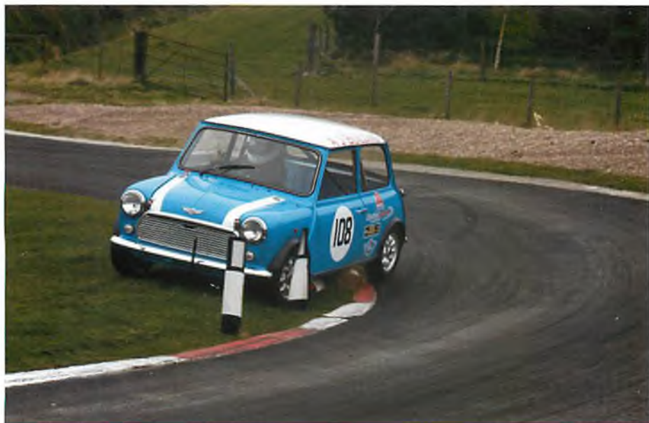
It's a Mini adventure by James Clarke!