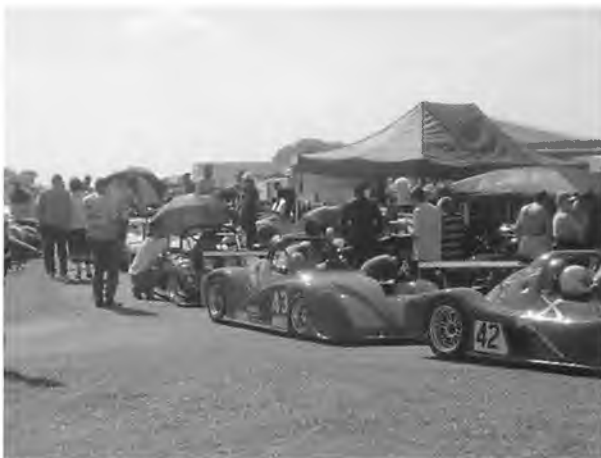
Cars queuing to go down to the start

At the finish line there is another light beam that stops the digital timing equipment for that driver's run. In addition to the start and finish timing beams at Harewood, there are other beams that allow the driver to see their 'split' times at given points on the course after their run.