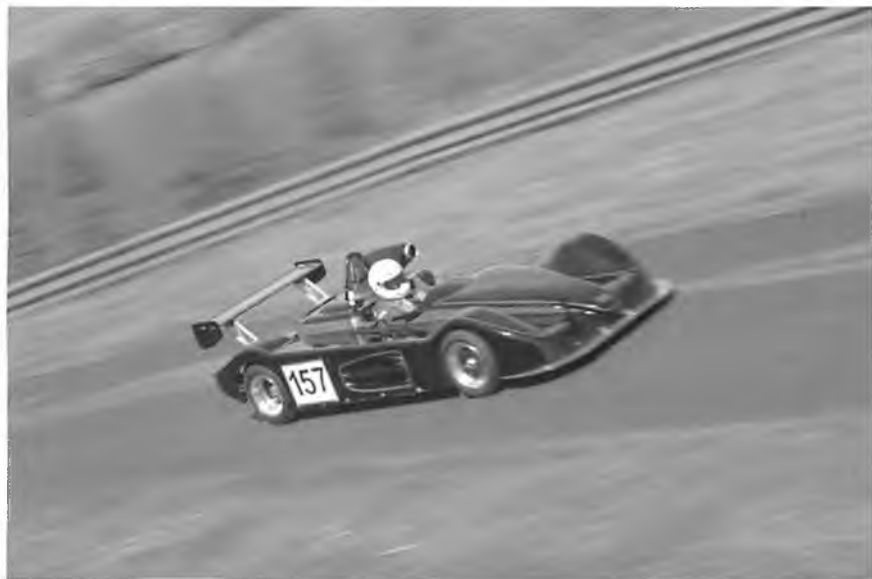
Two engines are better than one in Les Procter's case, with his OMS SC3G Sports Libre car