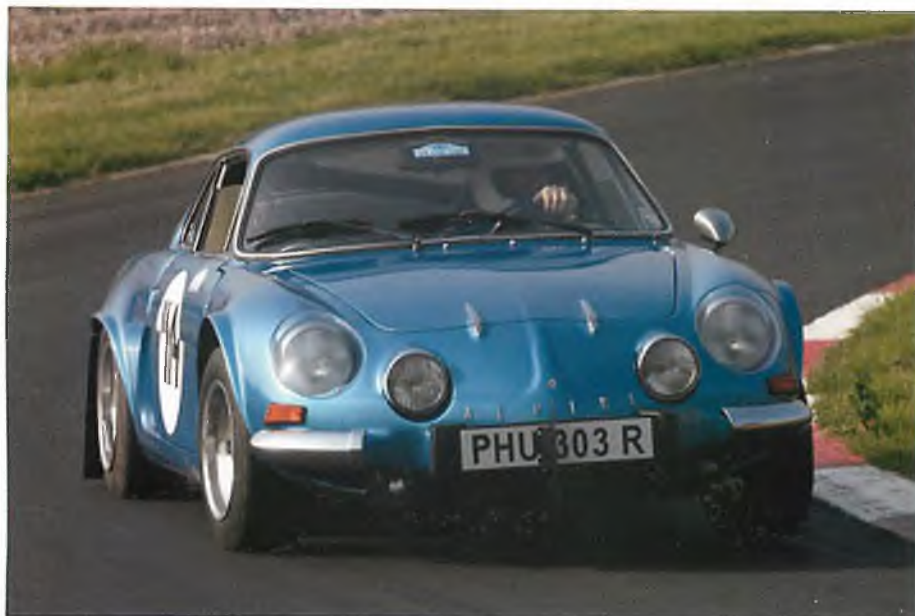
Stuart Clough takes tight line out of Farmhouse Bend in his superb Alpine Renault A110