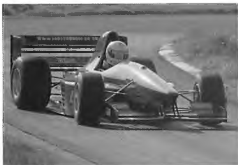
Adam Fleetwood

Nicholson McLaren MSA British Hillclimb Championship Permit No CHS04001 Power-Mec Leaders Championship Permit No CHS04002 Y Gelli Book Auctions Challenge Trophy Permit No CHS 04003 Lotus 7 Club 2004 Speed Championship