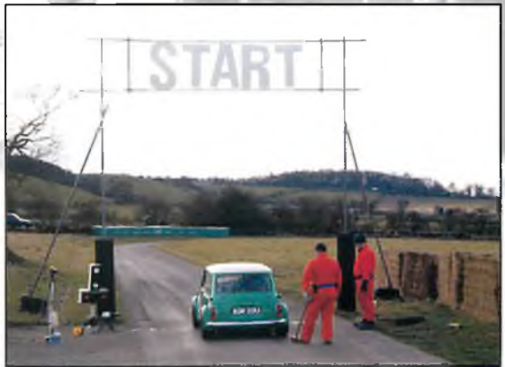
Leaving the start – note the lights and the marshal holding the wheel chock

Up to four cars can be on the hill at any one time. Timing is to the nearest one-hundredth of a second, a tiny amount, but one that can often decide a class win.