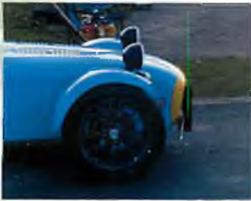
Timing strut

The challenge of Speed Hillclimbing is to drive the course in the shortest possible time. The faster drivers are those who can get the car off the start quickly, the first 64 feet often takes as little as two seconds, and then find the quickest and smoothest lines through each corner. The fastest cars can complete the 1448 metre course in a little over 50 seconds, with speeds exceeding 125 mph!