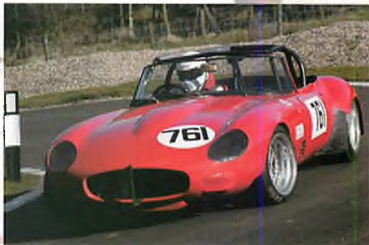
Haydn Spedding in the Jaguar E Type