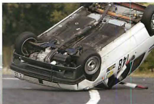
Mike Geen's 205. Up on the roof!