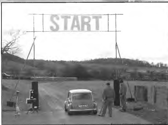
Leaving the start – note the lights and the marshal holding the wheel chock

Up to four cars can be on the hill at any one time. Timing is to the nearest one-hundredth of a second, a tiny amount, but one that can often decide a class win.