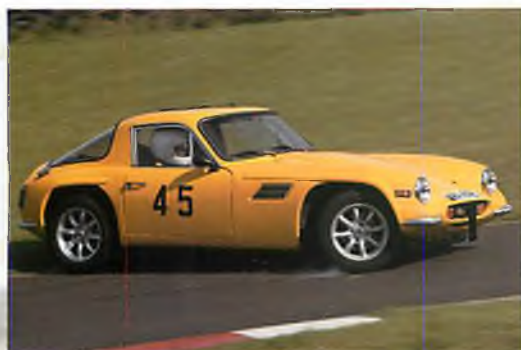
Slip sliding away! Stuart Lobley in the TVR Vixen S4