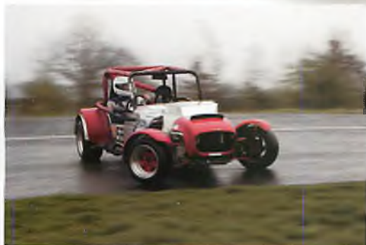
Sideways to victory? Phil Concannon lets it all hang out in the Locost