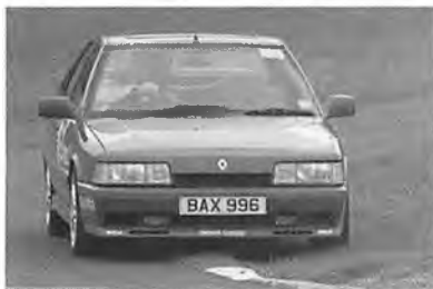
Left Mike Baxter in the Renault 21 Turbo at Orchard