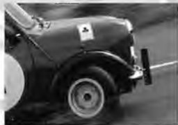
Timing strut

Cars are called down to the start in class order. Where a car is shared by another driver, the second driver (their numbers will start with a 7 or 9), will follow as soon as possible after the first driver's run. The entries are divided into classes, so that similar cars compete against each other. Each driver not only competes in his or her own race against the clock, but also against other drivers in cars of similar performance.