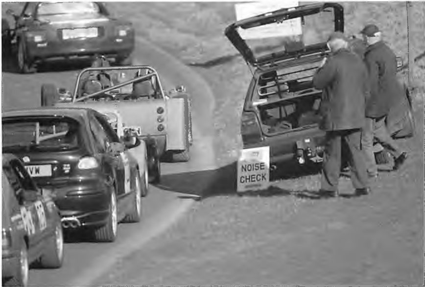
Cars being noise checked before a run.

And a round of RSSOC Sprint & Hillclimb Championship Permit No. CHS05057, Luffield Speed Championship and Chester MC and Liverpool MC Championship