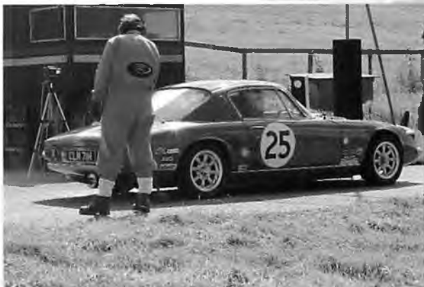
Leaving the start – note the marshal holding the wheel chock

If a car stops, slows or comes off the course, the marshals may show a red flag. This warns following drivers of a potential hazardous situation ahead. As a result a car may have to abandon a run through no fault of the driver and so will be given a re-run. If the red flag is given before Orchard the driver will return to the start via the road behind the barn. Otherwise the driver will continue to the finish, at a slower speed, then go down to the start via the slip road, to take the re-run.