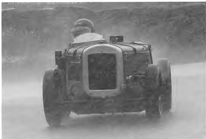
Last year was a little wet!