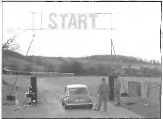
Leaving the start – note the lights and the marshal holding the wheel chock

Up to four cars can be on the hill at any one time. Timing is to the nearest one-hundredth of a second, a tiny amount, but one that can often decide a class win.