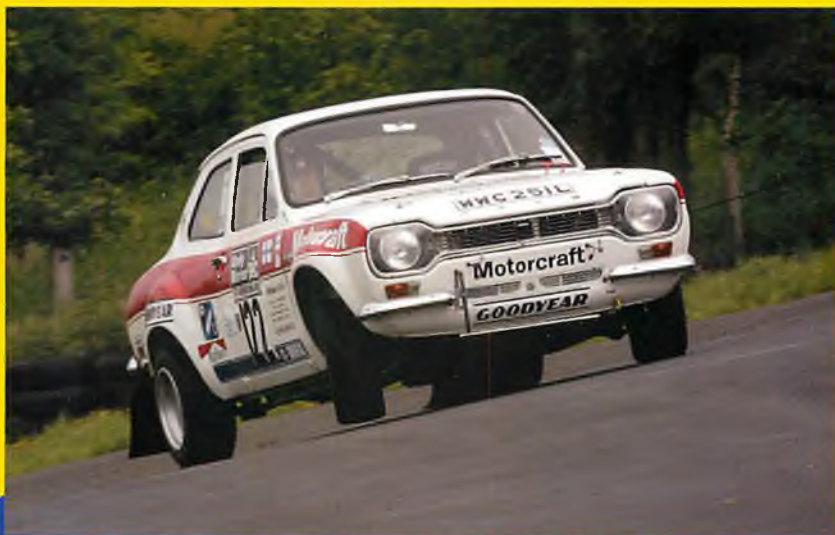
Chris Wise's superb ex-Works Escort RS is used in anger

Sunday 28th August 2005 Summer Championship