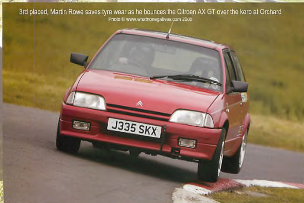
3 rd placed, Martin Rowe saves tyre wear as he bounces the Citroën AX GT over the kerb at Orchard