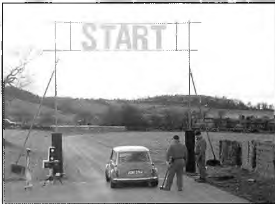
Leaving the start – note the lights and the marshal holding the wheel chock

Last year a mere 0.16 of a second decided the championship, which takes the best scores out of six events! The ultimate achievement at each event is to establish the Fastest Time of the Day (FTD). This is usually claimed by one of the high-powered single seater racing cars, although wet weather can sometimes throw up an occasional surprise!