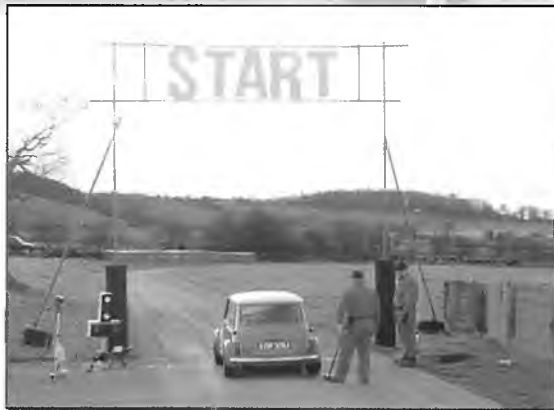
Leaving the start – note the lights and the marshal holding the wheel chock

Up to four cars can be on the hill at any one time. Timing is to the nearest one-hundredth of a second, a tiny amount, but one that can often decide a class win.