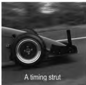
A timing strut

Cars are called down to the start in class order. Where a car is shared by another driver, the second driver (their numbers will start with a 7 or 9), will go down to the start in the batch before the other driver. The entries are divided into classes, so that similar cars compete against each other. Each driver not only competes in his or her own race against the clock, but also against other drivers in cars of similar performance.