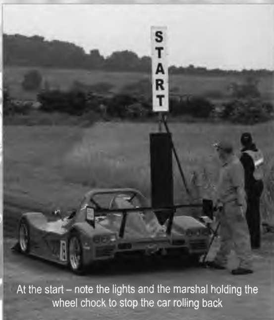
At the start – note the lights and the marshal holding the wheel chock to stop the car rolling back

The ultimate achievement at each event is to establish the Fastest Time of the Day (FTD). This is usually claimed by one of the single seater racing cars, although wet weather can sometimes throw up an occasional surprise!