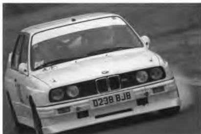
Richard Pope locks up the left hooker BMW E30 M3 at Orchard