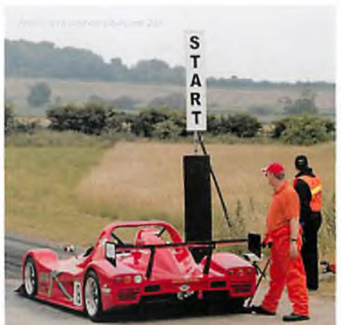
At the start – note the the marshal holding the wheel chock to stop the car rolling back

The ultimate achievement at each event is to establish the Fastest Time of the Day (FTD). This is usually claimed by one of the single seater racing cars, although wet weather can sometimes throw up an occasional surprise!