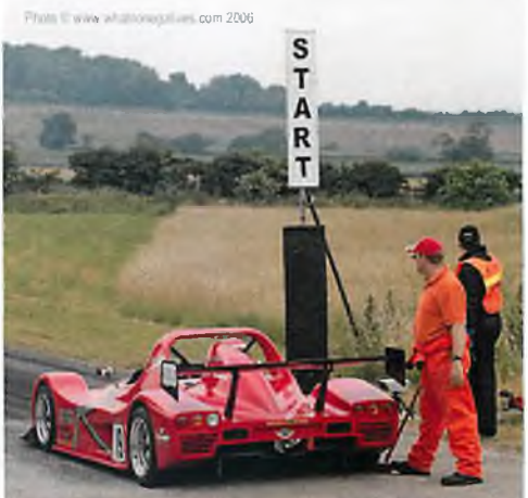
At the start – note the the marshal holding the wheel chock to stop the car rolling back

The ultimate achievement at each event is to establish the Fastest Time of the Day (FTD). This is usually claimed by one of the single seater racing cars, although wet weather can sometimes throw up an occasional surprise!