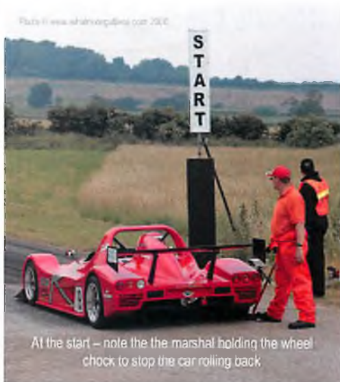
At the start – note the the marshal holding the wheel chock to stop the car rolling back

The ultimate achievement at each event is to establish the Fastest Time of the Day (FTD). This is usually claimed by one of the single seater racing cars, although wet weather can sometimes throw up an occasional surprise!