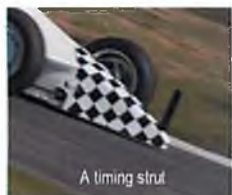
A timing strut

The challenge of Speed Hillclimbing is to drive the course in the shortest possible time. The faster drivers are those who can get the car off the start quickly, the first 64 feet can take under two seconds, and then find the quickest and smoothest lines through each corner. The fastest cars can complete the 1448 metre course in under 50 seconds, with speeds exceeding 130 mph!