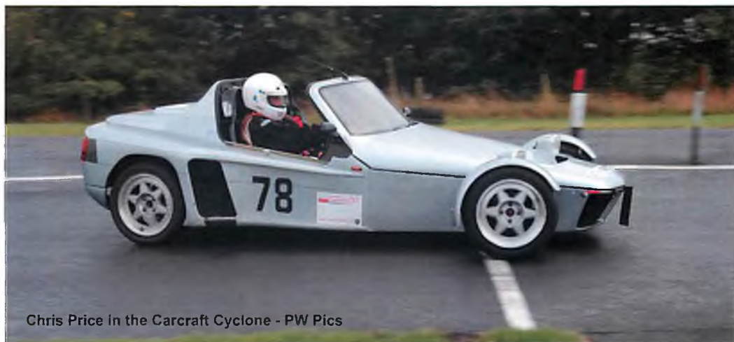
Chris Price in the Carcraft Cyclone

Class 2A – Road Modified Kit, Replica Etc Up To 1700cc