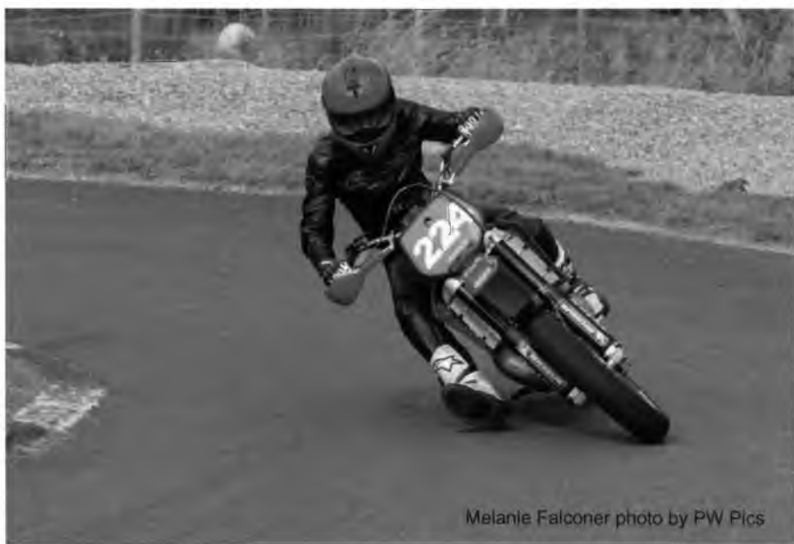
Melanie Falconer

Class B2 – Motor Cycles over 250cc and not over 350cc