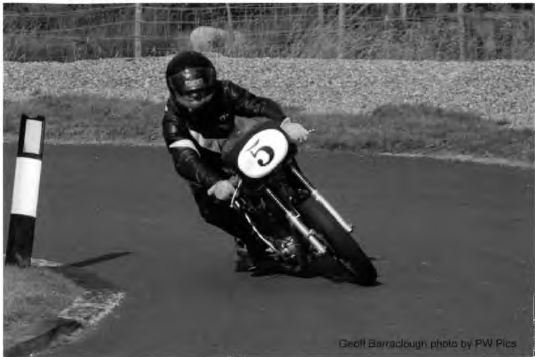
Geoff Barradough