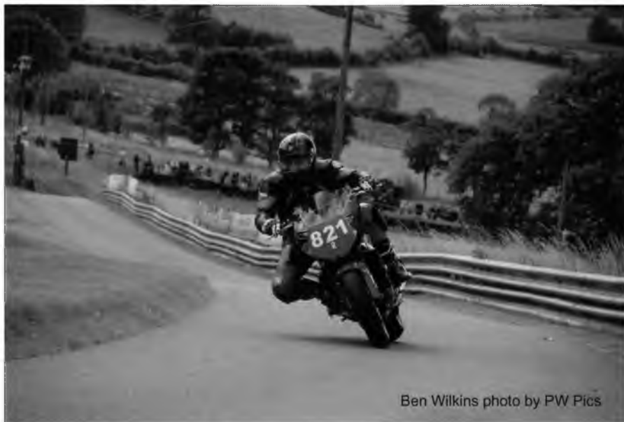
Ben Wilkins

Class B6 – Motor Cycles Side Cars and Three Wheelers - One Wheel Drive