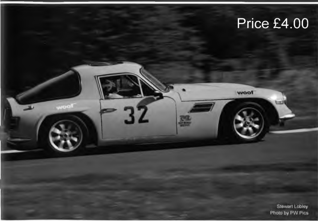
Stewart Loblely