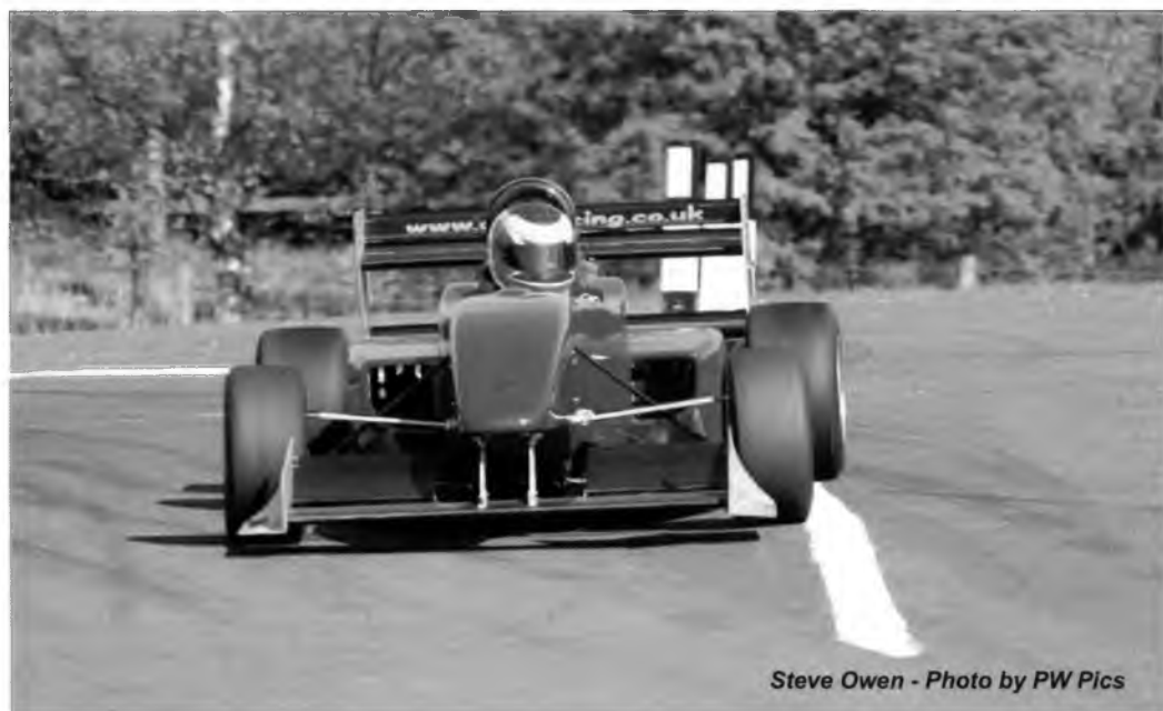
Steve Owen