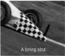
A timing strut

The challenge of Speed Hillclimbing is to drive the course in the shortest possible time. The faster drivers are those who can get the car off the start quickly, the first 64 feet can take under two seconds, and then find the quickest and smoothest lines through each corner. The fastest cars can complete the 1448 metre course in under 50 seconds, with speeds exceeding 130 mph!