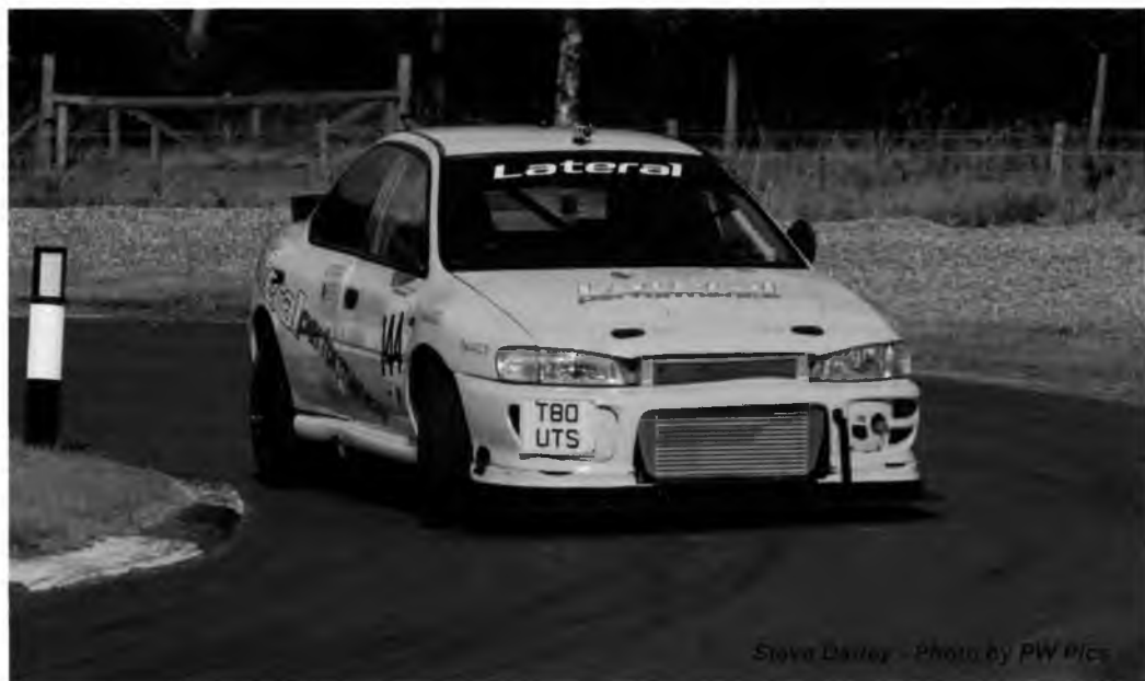
Steve Dadey