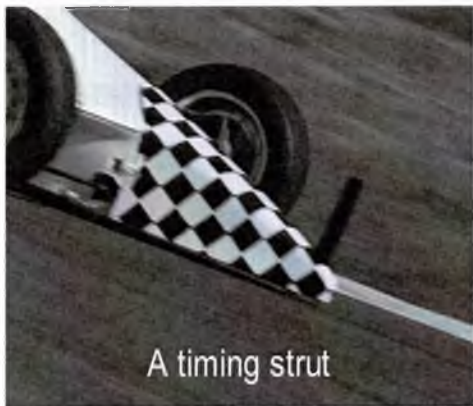
A timing strut

The challenge of Speed Hillclimbing is to drive the course in the shortest possible time. The faster drivers are those who can get the car off the start quickly, the first 64 feet can take under two seconds, and then find the quickest and smoothest lines through each corner. The fastest cars can complete the 1448 metre course in under 50 seconds, with speeds exceeding 130 mph!