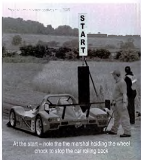
At the start - note the the marshal holding the wheel chock to stop the car rolling back

The ultimate achievement at each event is to establish the Fastest Time of the Day (FTD). This is usually claimed by one of the single seater racing cars, although wet weather can sometimes throw up an occasional surprise!