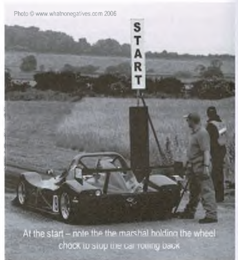
At the start – note the the marshal holding the wheel chock to stop the car rolling back