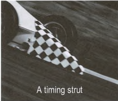
A timing strut

The challenge of Speed Hillclimbing is to drive the course in the shortest possible time. The faster drivers are those who can get the car off the start quickly, the first 64 feet can take under two seconds, and then find the quickest and smoothest lines through each corner. The fastest cars can complete the 1448 metre course in under 50 seconds, with speeds exceeding 130 mph!