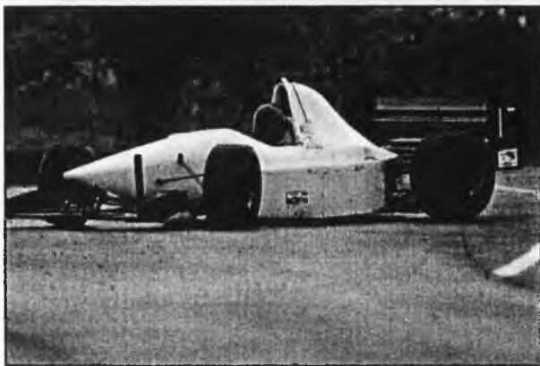
FTD winner Martin Groves

Not only was there some great racing, but the Yorkshire Centre had also laid on a classic car and bike show, a new car display, a racing truck, BBC filming and various other attractions to satisfy the high number of spectators.