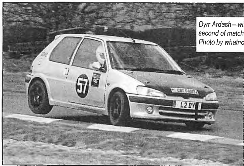
Dyrr Ardash—within a tenth of a second of matching the class record