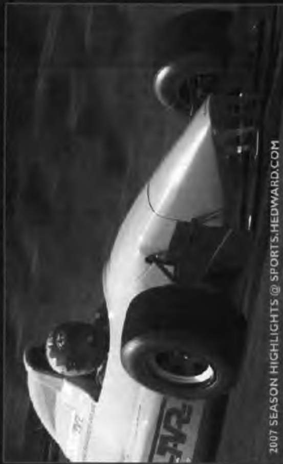
2007 SEASON HIGHLIGHTS @ SPORTS.HEDWARD.COM