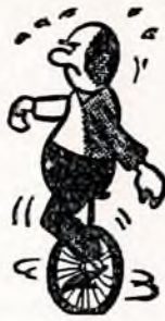
Chippy at Harewood

NEW AUSTIN & MORRIS CARS and QUALITY USED CARS