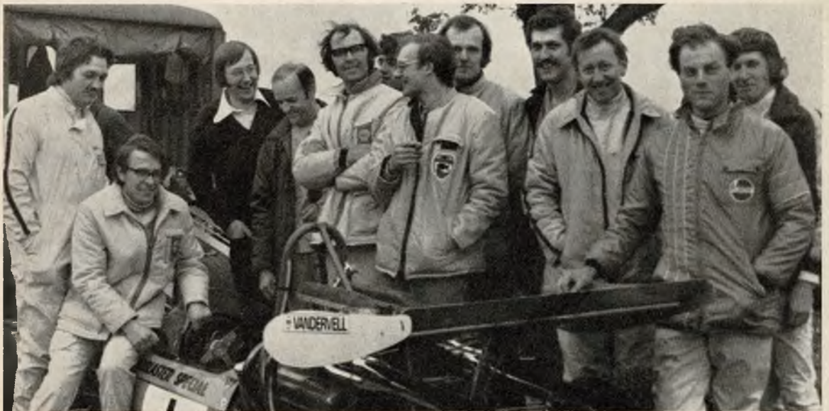
Although this was the final of the Castrol Championship, a motley collection of the Shell/R.A.C. contenders were entered, most of whom are seen here surrounding the Hepworth entry.