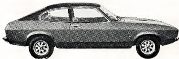
THE FORD CAPRI II WITH 3 DOORS