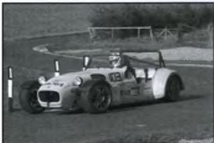
Henry Moorhouse

In the up to 1700cc group, the Westie of Henry Moorhouse took the win, with a 63.72, whilst in the over 1700cc group, it was the similar car of Harry Moody on 66.52.