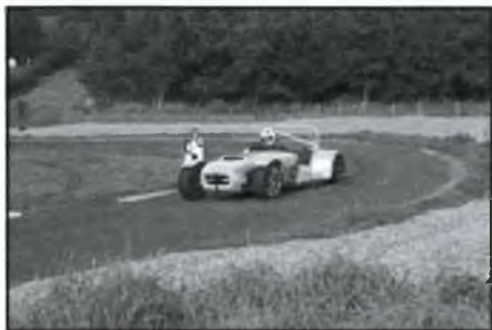
Mick Lancashire from the Channel Islands

The big kit cars in class 5 were merged with class B and unsurprisingly it was the mod prod class that produced the victor, David Spaul hustled his 2 litre Westie up the Stockton Farm track to take the class in 60.62, Mick Lancashire