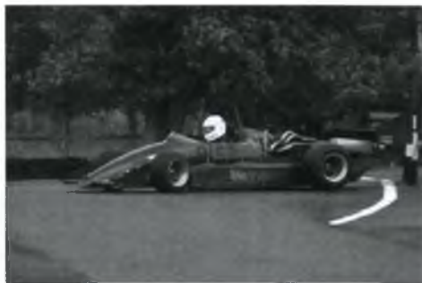
The Allenet Ralt

As the season closed at Harewood on yet another well run and successful meeting the champions were already starting to rehearse their speeches ready for the November Awards Dinner. Meanwhile the hard-working marshals and organisers were still working hard to get the venue ready for winter. Plans are already being made for changes, upgrades, new cars etc and if 2010 is anything to go off next year already looks like being another classic season.