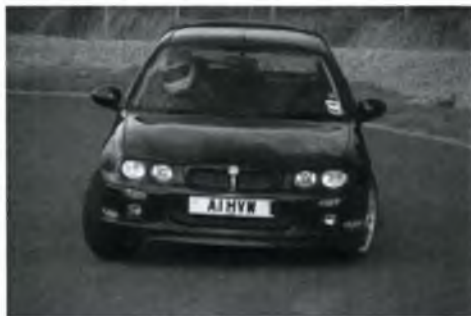
David Coulthard

First to tackle the hill were the MGs. Class 15A for standard cars was down a little, with three 'no shows', due to mechanical maladies. This allowed David Coulthard in the ZR 160 to take the class with a 71.56, despite encountering on-track obstructions during run 3!