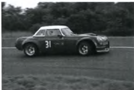
Terry Pigott