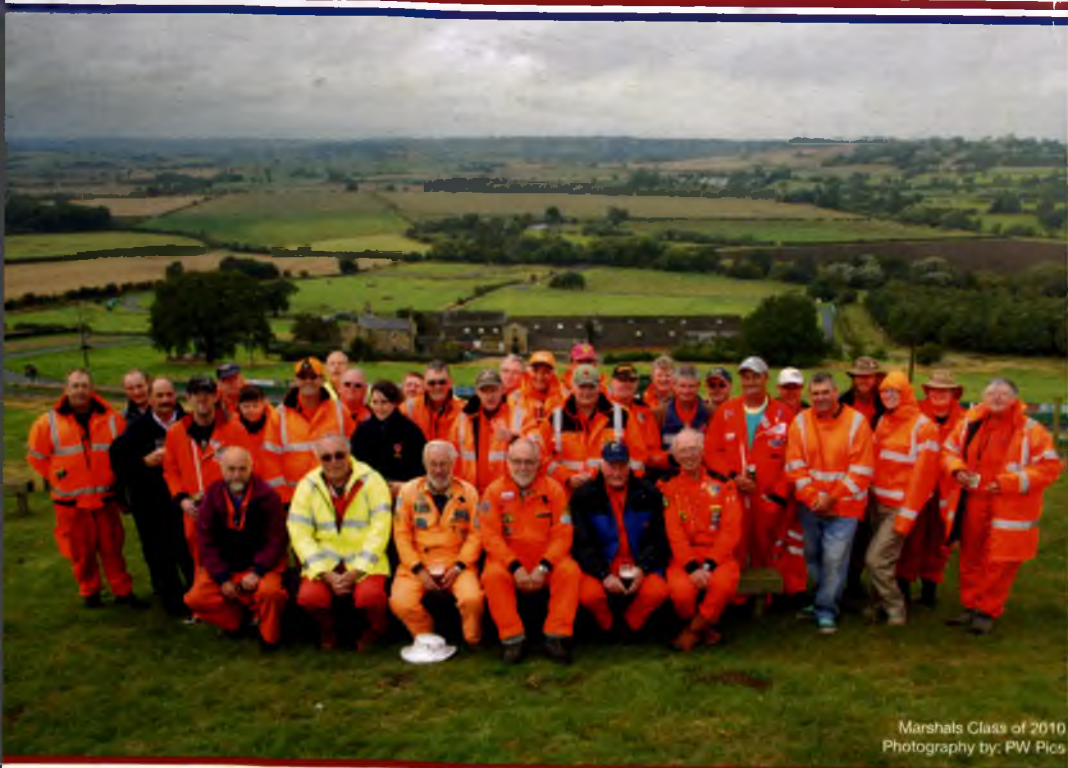
Marshals Class of 2010