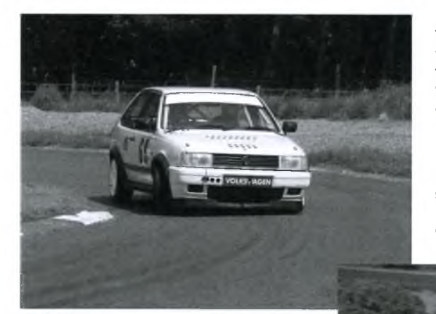
The 3rd round of the Harewood Championships were held under clear skies and a strange glowing yellow orb? Unfamiliar so far this year but very welcome! It warmed spectators and competitors alike andcertainly helped the times with many new PBs on the day - let's hope it's here to stay.

A terrible pun I agree but possibly the best way to express many a competitors delight as a mixture of slick organisation and few incidents resulted in FOUR timed runs at Sundays Jim Thomson Trophy meeting.