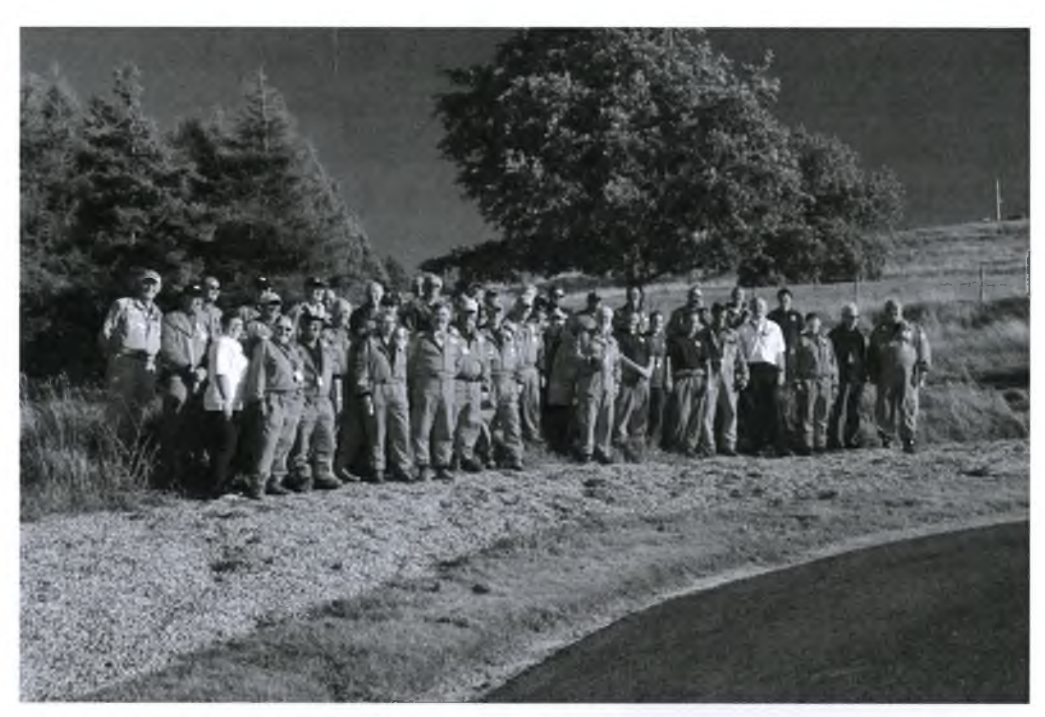
CLASS OF 2013—Harewood Marshals