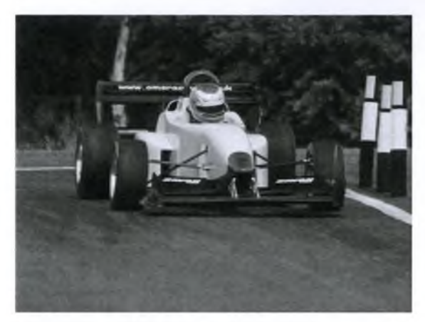
OMS Constructor-Steve Owen in the new OMS 28

The absence of James Kerr for this round benefitted much of the rest of the top ten as they all ascended 1 position in the leaderboard,