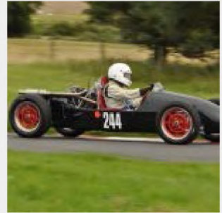
— Charles Reynolds Cooper Mk7 (PWPics)