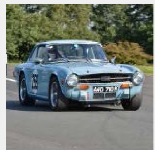
— Jim Johnstone Triumph TR6

The Championship was sealed leaving just the FTD Trophy to find a home and as people squared away their cars in the paddock the sun still shone and it look set for another good day on the hill but would the weather play ball?