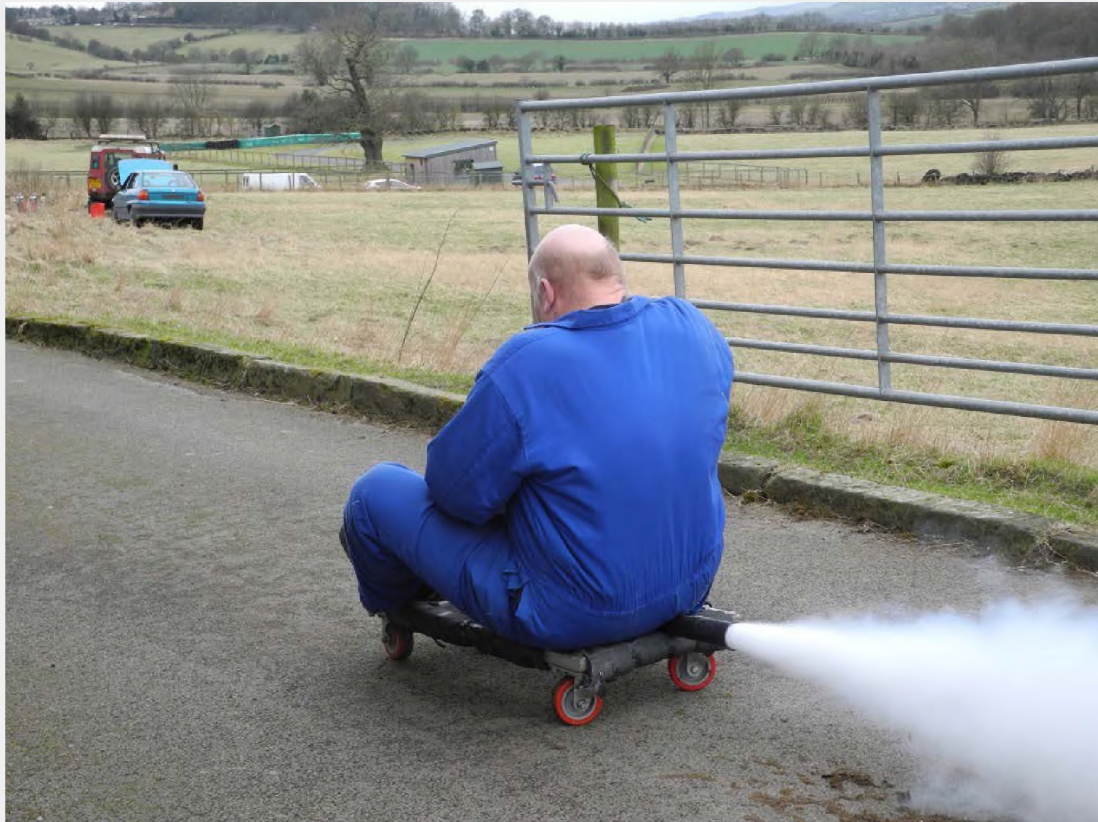
— World's first vindaloo-fuelled rocket-car undergoing testing at Harewood.. (Mr C)