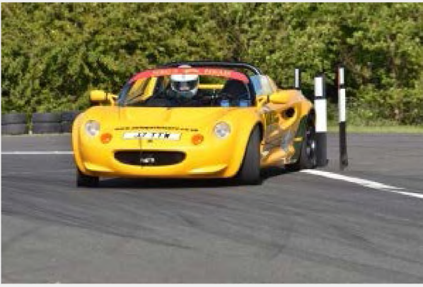
— Tracey Taylor-West Lotus Elise (PWPics)